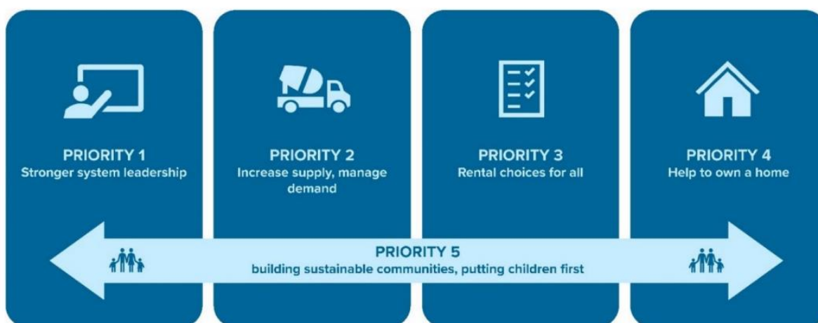
Figure 1: Five priorities for taking action to create better homes

The Creating Better Homes action plan 4 set out five strategic priorities, as shown in figure 1 below.