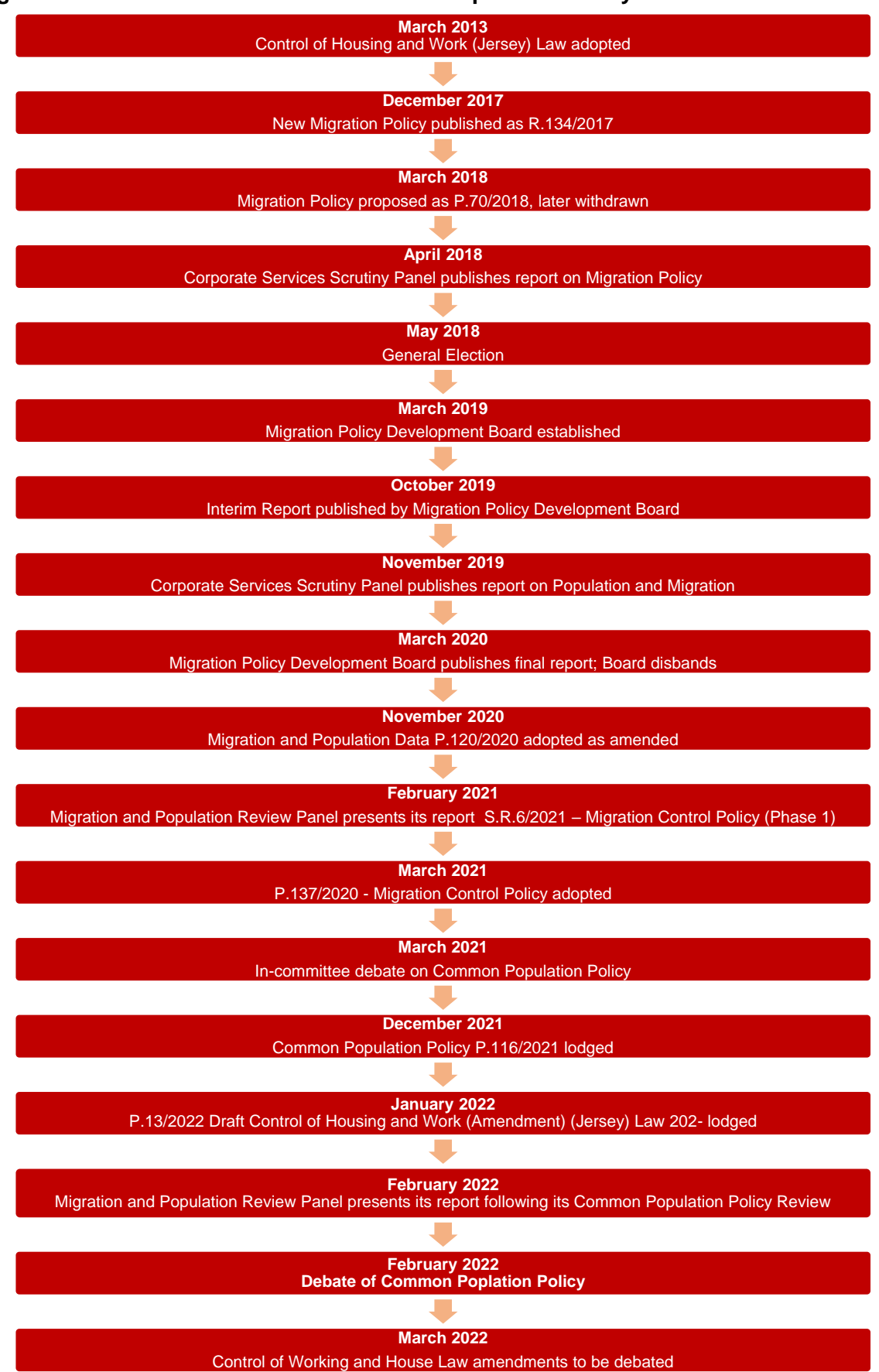
Figure 1 - Timeline to P.116/2021 Common Population Policy